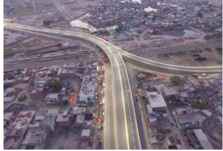
⦿ Flyover Over Railway Crossing Kahna Kacha Lahore