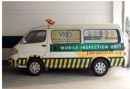
⦿ Punjab Vehicle Inspection Certification System (VICs)