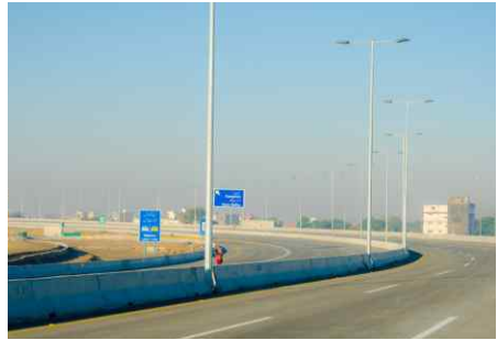
⦿ Lahore Ring Road Southern Loop (SL-I & SL-II)